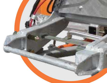
QUIK*LINK® IV ATTACHMENT

Built for medium- to full-size lighter trucks, the Arctic SD-P fits on all QUIK*LINK® mounts, and offers all the robust, dependable features Arctic is known for. Whether you are dusting off the street for a game of road hockey or are liberating your neighbors after a storm, the Arctic SD-P lets you get down to business. Winter doesn't wait for anyone – why should you?